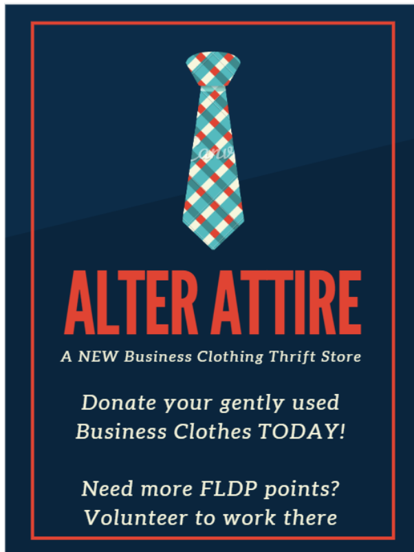
Exhibit 4- Example Flyers

*This is a Campus Sustainability Week event!