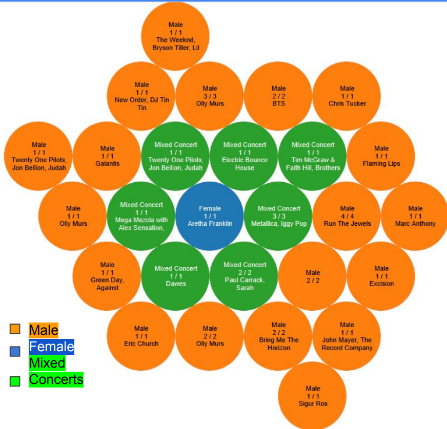
Breakdown of Sold Out Shows by Gender