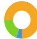
Number of Concerts by each Gender