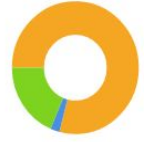
Sold Out Shows

Male (79.07%) Female (2.33%) Mixed (18.60%)