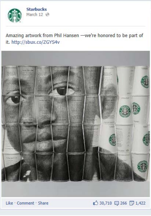
(P3-P4, People all around the U.S doing artwork on statbucks cups)