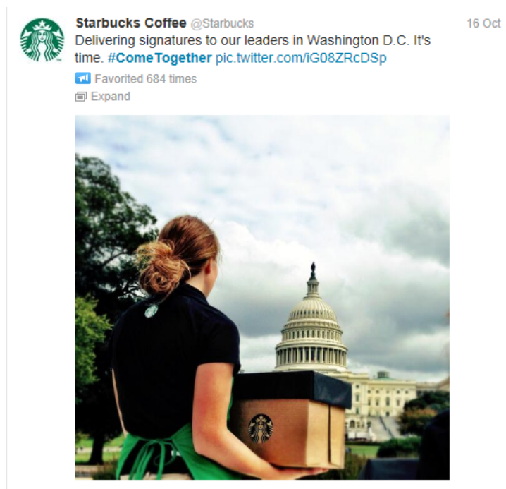
(P2- Starbucks create an event on twitter call #Come together)